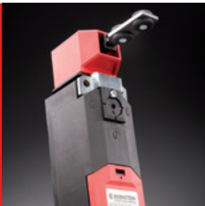
Switch systems – Economy meets safety