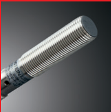
Sensor systems – Compact intelligence