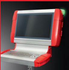
Enclosure systems – Function and design